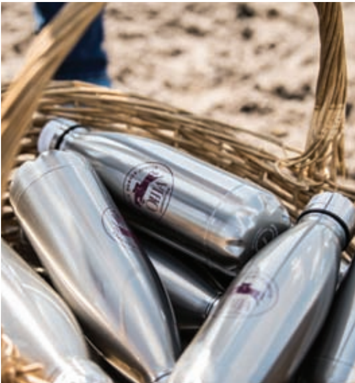
Some of the fantastic OHJA Prizes.