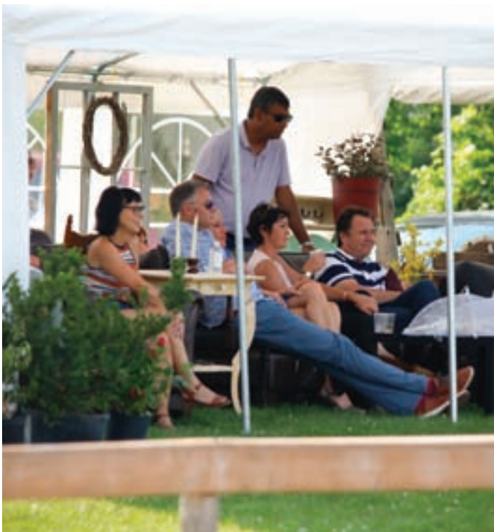
Spectators enjoying the show at Ten Sixty.