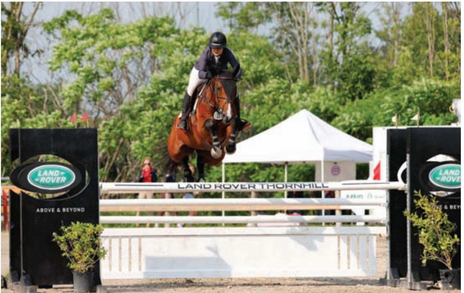
The beautiful jumper ring at Ten Sixty.

attends to have a good experience. In 2019, we were proud to offer significant prize money in our feature classes. At both of our shows we offered a10k for the Canadian Hunter Derby as well as 5k(welcome) and 15k(Grand Prix) for open Jumpers. In addition to these feature classes we tried to offer something special for everyone, a Classic or Derby for the hunters and ponies as well as Jumper Classics for all heights on the Sunday. We also believe that providing a venue for development is very important so we keep the rings open in the afternoon upon completion of competition so that trainers can school their clients and young horses.