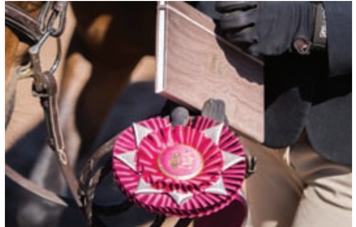
Some of the beautiful OHJA Ribbons.