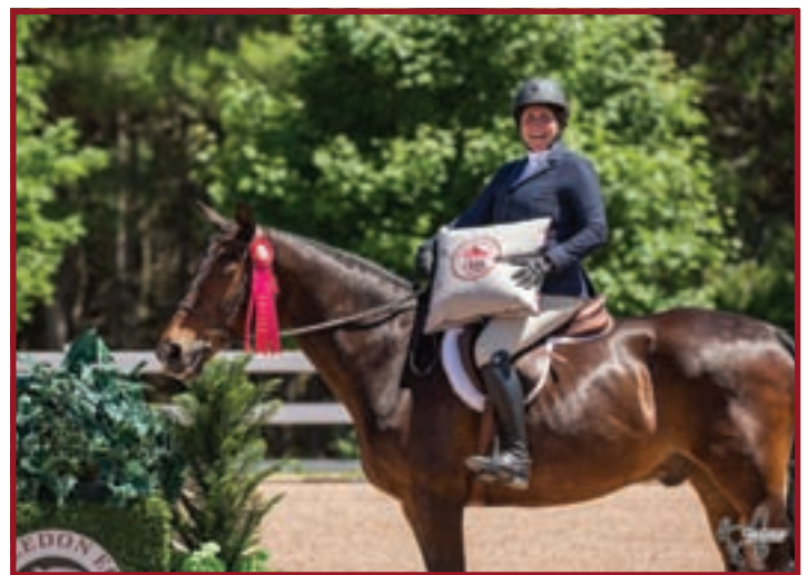
Beginner Adult OHJA Stake winner at the Summer Classi Patti Case and Pursuit of Happiness.